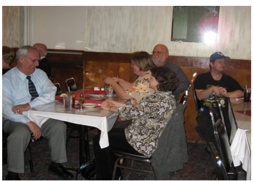
Members of the Midlands Coin Club at their Annual Banquet