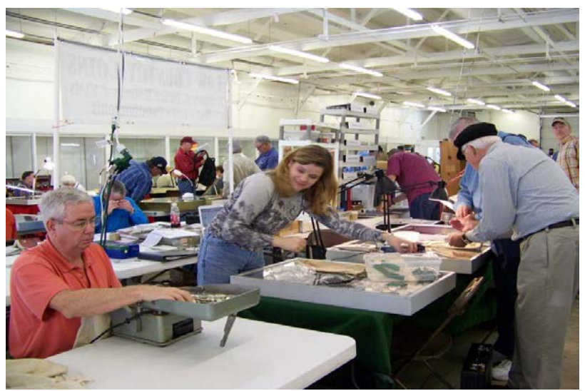
Carolina Coin Busy at the Low Country Coin Club Show